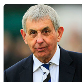
Sir Ian McGeechan OBE